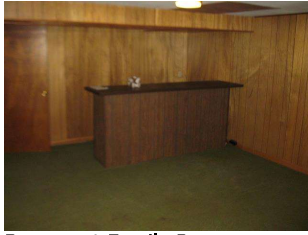
Basement Familv Room