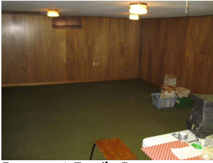
Basement Familv Room