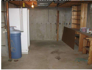
basement workshop area