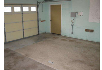
Attached garage Interior